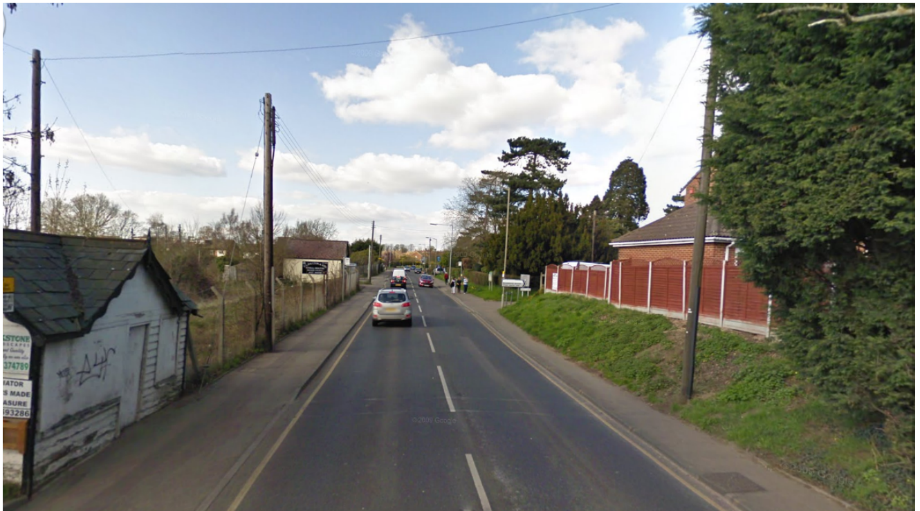
Figure 1 High Street, junction with Love Lane

These problems include the width of the footway being insufficient to accommodate a crossing. The current width varies from 1.0m to 1.2m; the required minimum width being 2.0m. Officers have investigated increasing the footway width at this point; however this section of verge does not form part of the publicly maintainable highway and so encroaching into the verge is the only solution to increase the footway width. The gradient of the verge (See Figure 1) means a brick retaining wall with concrete foundations would also be required. The ECC Structures Team have investigated this and estimated the costs of constructing such a feature would be in the region of £20,000.